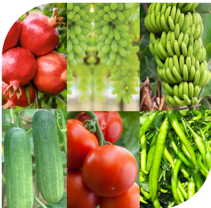
Bio-stimulant For Healthy Growth and quality yield