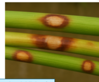
Symptoms showing sheath blight of rice