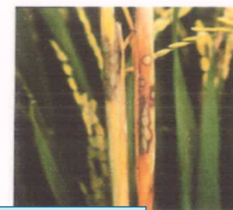
Performance of Rubitrol over control (%)