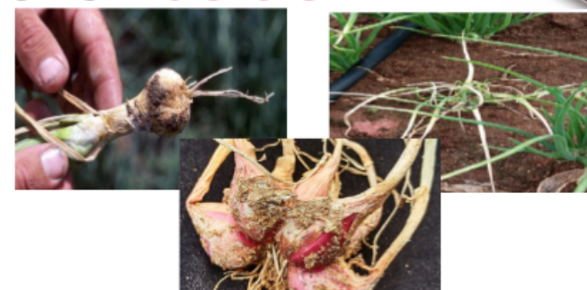
Symptoms of Onion infected by Basal rot