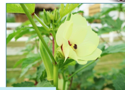
Okra crop field