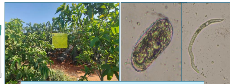
Trial plot and Nemasol M5 treated egg and adult of nematode