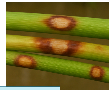
Symptoms showing sheath blight of rice