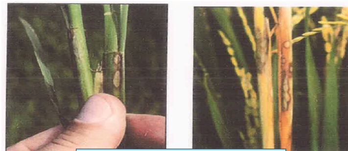
Symptoms showing sheath blight of rice