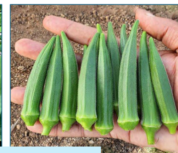
High quality okra fruits