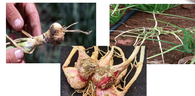
Symptoms of Onion infected by Basal rot