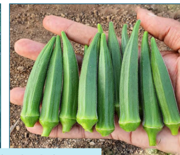
High quality okra fruits