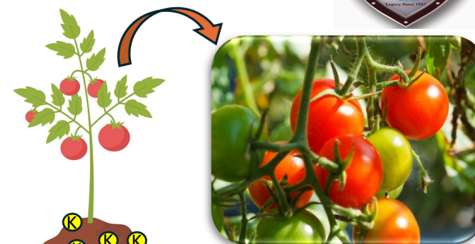
K Bac Plus enhances K availability and fruit quality