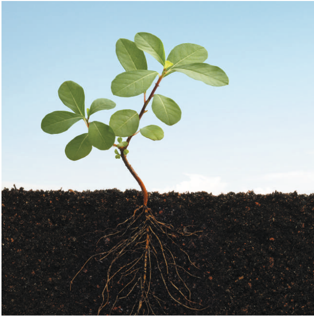
A PLANT SUPPLEMENT ENRICHED WITH NATURAL ENZYMES FOR STRONGER AND HEALTHY PLANTS